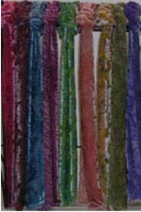
Devore Silk Velvet