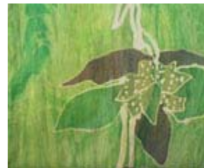
Orchid - Satin