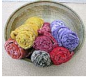
Devore Silks $30.00