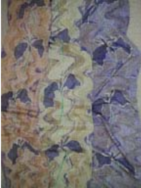
Iris – Satin $30 ea 15 x 60 Purple IR01 Orange IR02 Pink IR03