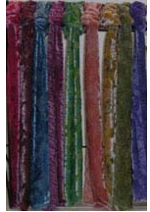
Devore Silk Velvet