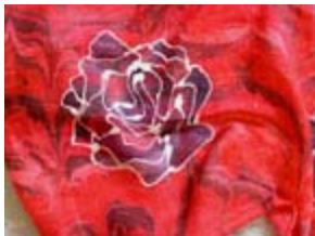
Rose – Satin $30 ea 15 x 72 RED R001

Butter FW01 Blue FW02 Purple FW03 Teal FW04