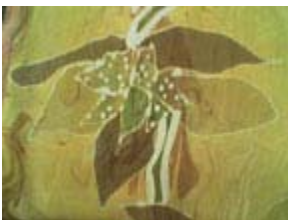
Orchid – Satin