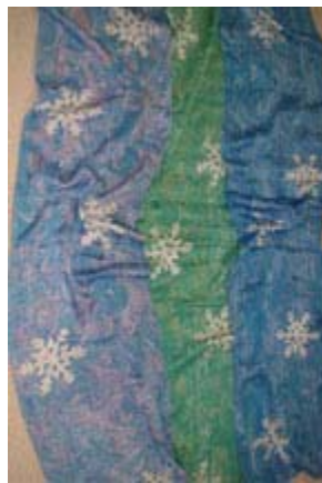
Snowflake - Satin $20 ea 15 x 60

Pink SF01 Purple SF02 Lime SF03 Cobalt SF04