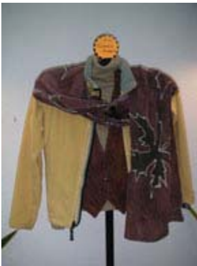
Maple Leaf – Crepe $30 ea 15 x 72 Chocolate ML01 Olive ML02 Peach ML03 Burgandy ML04 Gold ML05