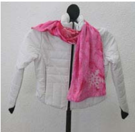
Snowflake – Pink