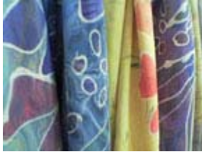
Fireweed – 4 colors 15 x 72 – satin