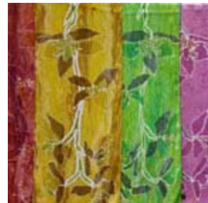
Orchid – Satin $30 ea 15 x 72 Butter OR01 Apple OR02 Cinnamon OR03 Raspberry OR04