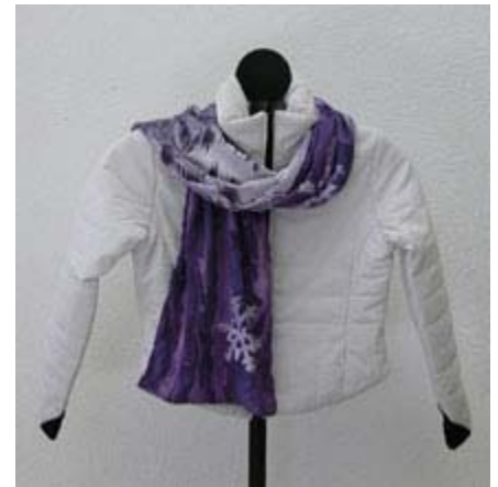
Snowflake – Purple

Pink SF01 Purple SF02 Lime SF03 Cobalt SF04