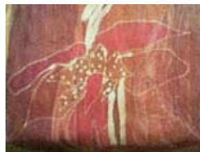
Orchid – Satin