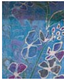
Fireweed – Blue