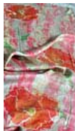
Poppy – Satin $30 ea 15 x 60 Olive PP01 Peach PP02 Teal PP03