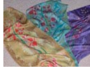
Fireweed - Satin $30ea

Butter FW01 Blue FW02 Purple FW03 Teal FW04